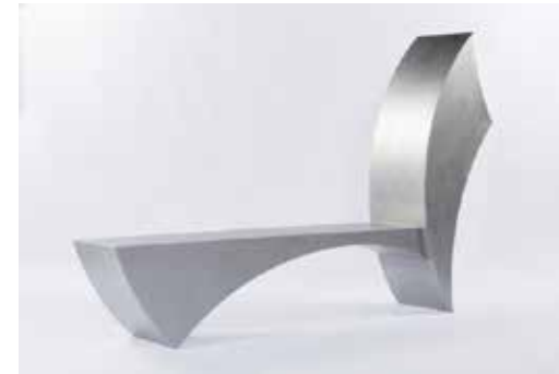
Bench Series: 3, Charles Crowley