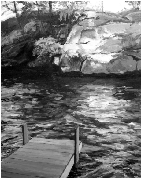
Rock Island, Lisa Marder

Explore this versatile medium while learning the basics of drawing and painting. We will use still life, photographs, the landscape, the figure, sketchbooks, and works of other artists as sources of inspiration. While experimenting with color, line, value, texture, and composition we will produce both representational and abstract works in a fun, relaxed, and supportive atmosphere. Beginning as well as continuing students are welcome. No class May 14. 5/7–6/18 Thurs pm 6:30–9:30 $205M $250NM 6 classes