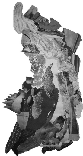
Wave, Jennifer Wood

Collagraph printmaking appears to be simple but often produces sophisticated works, with brilliant colors and dramatic tonal value. It is an inspired process that involves making your own plate with mat board and textured materials such as gesso, carborundum, glue, fabric and more. Imagery can be extremely varied. Learn to make one (or more plates) and print from it as relief, intaglio or both. Instruction in composition, inking, wiping, color mixing and printing is provided. Guidance and critiques are given by the instructor individually and as a group. For enhanced creative depth add mixed media applications to your work, using the same or related materials, incorporate complementary elements in your prints with varied materials such as charcoal, oil pastel, handmade stamps. Instructor will assist with aesthetic direction as needed. Beginners welcome. Non-toxic clean up for printmaking sessions. 5/23–5/24 Sat–Sun 10:00–4:00 $165M $195NM 2 classes