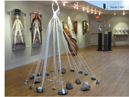
torqued & tethered... , Virginia Fitzgerald