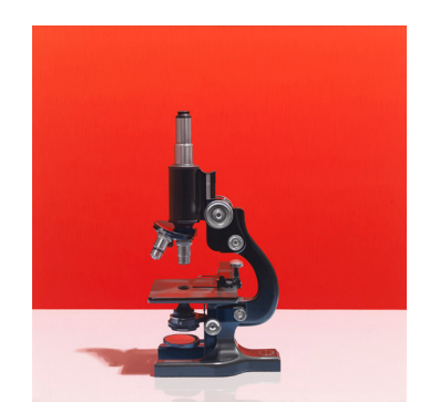
Bench Series: 3, Charles Crowley