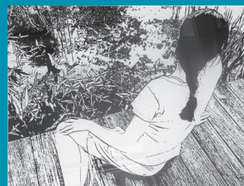
Solitude , Sue Hoy