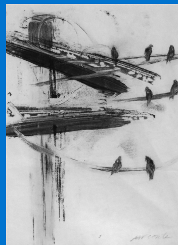
Birds on a Wire , Ann Conte

61 st Arts Festival June 17-19, 2016 Exhibitions Call for Entries Juried Exhibition • Members' Show Young Artists' Show