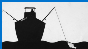
Fishing , Spencer Reid