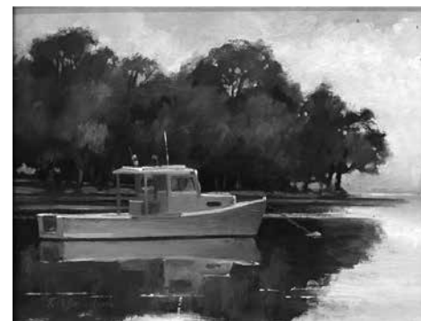
Misty Harbor, Robert Beaulieu

This course is focused on creating a plein-air painting based on effectively composed man-made mechanical and/or architectural objects such as lobster boats, sailboats, summer cottages, or harbor store fronts. Course content will cover atmospheric perspective expressed through color and value, and the