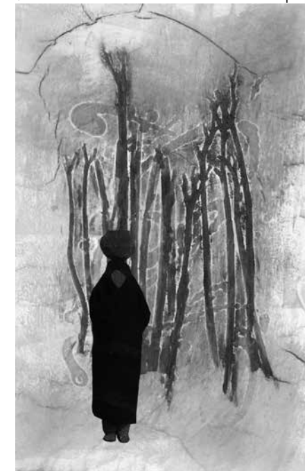
Zuni, Esther Maschio

Solar plate is one of the exciting newer technologies that make etching low-tech and safer to use than traditional methods. This is a photo-etch process. Plates are created by UV light (using an exposure box) and developed with water rather than chemicals. Both plates and prints can be made within one hour and multiple prints can be made from a single plate. Students will create an intaglio image using their own art work or sketch as a starting point. A relief print will be produced, again with original art work as an image base. Inking and printing will be done each day as part of the learning process which will also include multiple plate printing and editioning. This is an opportunity to express your creative self in a new and different way. All levels welcome. Early registration is required as solar plates must be ordered by the student. Additional, specific information will be given by the instructor upon enrollment. No class October 12. 10/5–12/14 Mon pm 6:00–9:00 $275M $315NM 10 classes (includes $20 materials fee for inks and limited paper)