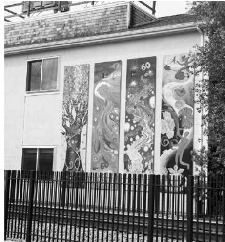
Art Stars Mural 2015

For information on rental of the galleries, please call 781 383 2787 or visit www.ssac.org