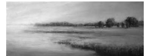
River Memory, Donna Rossetti-Bailey

This course for the intermediate and experienced pastel artist will provide five hours of uninterrupted studio and plein air painting time each week. Each session will include instruction, one-on-one easel time, critiques, and lots of information exchanges. All students will be encouraged to express their own personal style and imagery. We will have fun, laugh and learn from one another in this extended class. We will work outside when weather permits. Some materials provided. Bring your lunch. No class November 11 & 25. 9/16-12/2 Wed 9:00-2:00 $350M $395NM 10 classes