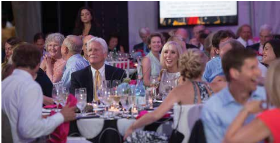
SSAC 60 th Art Festival GALA

South Shore Art Center enriches the communities south of Boston by engaging artists and by fostering an understanding and appreciation of the visual arts through exhibitions and education.