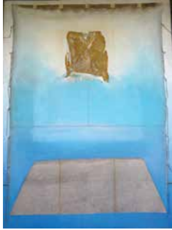
Crossing with the Wind , Walter Pashko

Opening Reception: Friday, Sept 18, 6–8 pm