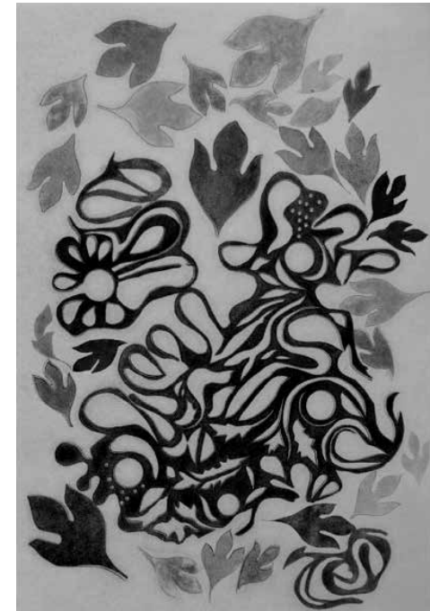
Slow Turning, Monice Morenz

Collage is a process of constructing and layering ideas with common materials. This class will reference the works of several 20 th century contemporary artists. In Collage Part 2, students will continue to create images based on advanced themes in design, color, abstraction, and building a personal narrative. Starting with collage from the Surrealist years leading to collage art in the 1960s, we will examine a specific theme each week. There will be weekly class demonstrations and critiques. This class is a follow-up to the spring class, Classic Collage. 9/16–11/4 Wed pm 1:00–4:00 $215M $255NM 8 classes