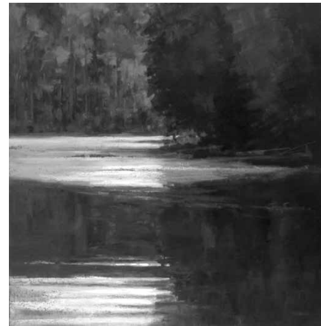
Meditate, Ed Chesnovitch

The ability to draw is not inherited, it is a learned skill, directly related to one's observational skills. Being able to see the basic structure of all objects is the first step (similar to reading music). Through a series of exercises, assignments, and homework, students will strengthen their observational and drawing skills. Composition, value studies, line, texture and color will broaden their understanding of the drawing process. This class can accommodate both beginner and intermediate levels in a supportive environment with lots of one-on-one instruction. Continuing students welcome. 9/19–11/7 Fri am 10:30–1:30 $215M $255NM 8 classes