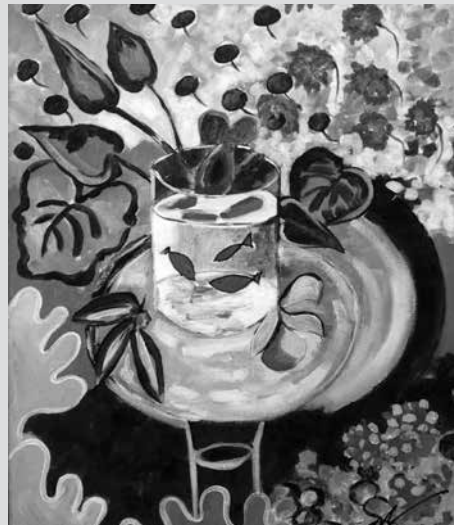
After Matisse—Marion Carlson

You can draw! Each week, a principle and element of design will be introduced. Through a series of exercises this hands-on approach will give you the tools to have a successful drawing. You will learn about the function and creative application of line, texture, value, contrast, negative space and more in this supportive two-hour class. No class November 11. 10/7–12/2 Tues pm 1:00–3:00 $185M $205NM 8 classes