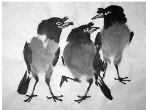
Painting by Qingxiong Ma

With techniques directly related to Chinese calligraphy, this course will introduce the basics of Chinese brush painting. Students will explore birds and flowers with a combination of Chinese brush painting and Western techniques. Using freehand brushwork, the emphasis will be on expressiveness, individual interpretation and abstraction through exaggeration. Students will use ink, watercolor, gouache, and acrylic on rice paper to create wonderful visual effects. 4/28–4/29 Sat /Sun 10:00–4:00 $195M $235NM 2 classes