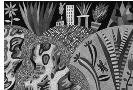
Painting by Lisa Houck

Japanese woodblock prints are renowned for their detail and transparent colors and textures. In this technique, a carved woodblock (created by each student) is colored with watercolors and then printed by placing paper on the woodblock and rubbing the back with a tool called a baren. We will make a two color print, and experiment with different methods of hand coloring our prints. You will go home with all the information you need to continue printing on your own. Come prepared with photographs or drawings as inspiration for your print. 4/29 Sunday 10:00–4:00 $115M $155NM 1 class ($30 materials fee payable to instructor)