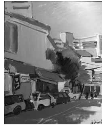
Sarasota, Ros Farbush

http://timwaitephoto.com/ssac/events/laiyh/index.html