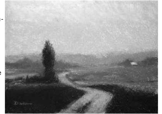
Morning Fog, Doug Dawson

The third day includes a demonstration of the use of warm colors to control the greens in a landscape and the general principles used to find color solutions. Students spend the rest of the morning and afternoon working on their own paintings.