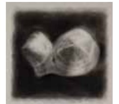
OBD No. 2 (detail), OBD No. 7 Bullet Bra, Lisa Knox